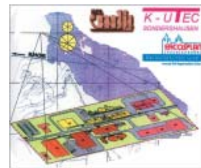
Scheme of the production plant